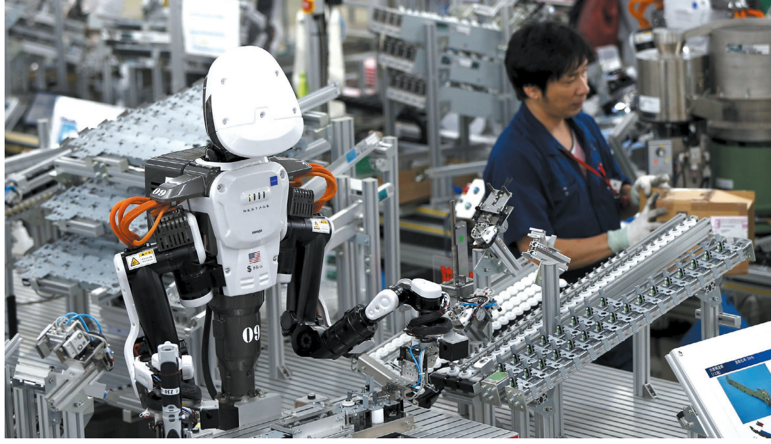
Humans and robots work alongside each other at Glory in Kazo, Japan, a maker of automatic charge dispensers.

predicting when a car component is likely to fail and fixing it swiftly avoids expensive recalls and litigation. In industries with low yields, such as semiconductor manufacturing, halving production errors substantially increases profits.